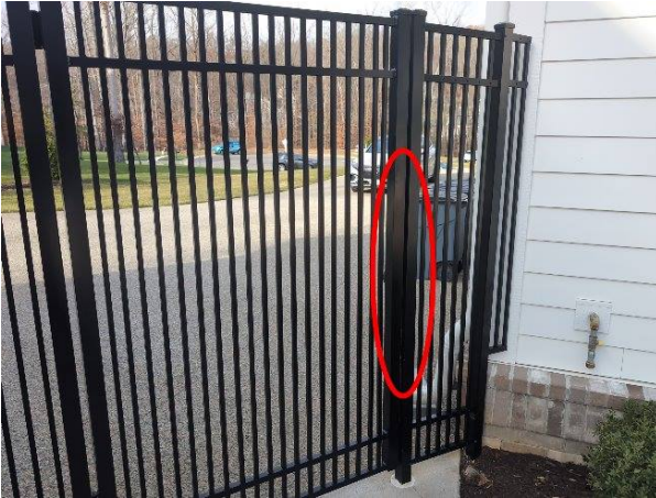
Unable to open from the inside

6: The front gate near the garage has the latch on the exterior. The latch is not easily reached from inside the gate. Correct as needed.